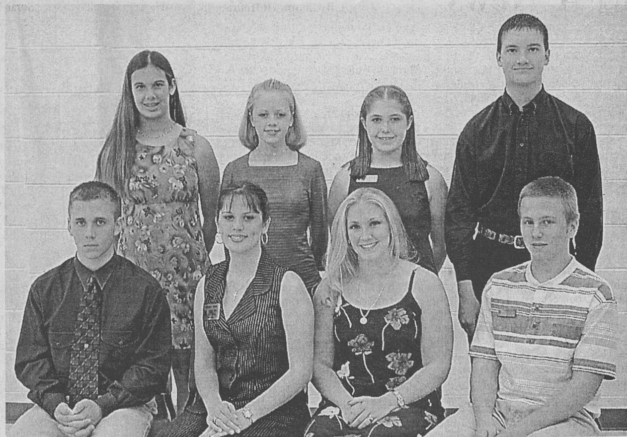
2000-01 4-H officers